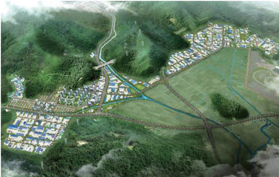
MIEUM DISTRICT OF BUSAN, JINHAE FREE ECONOMIC ZONES

Construction period Dec. 31. 2008 ~ Mar. 31. 2013