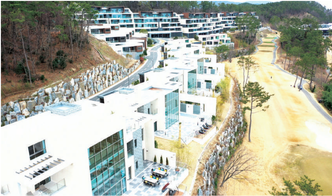
HAE UN DAE GOLF & RESORT

Construction period Apr. 20. 2017 ~ June. 05. 2019