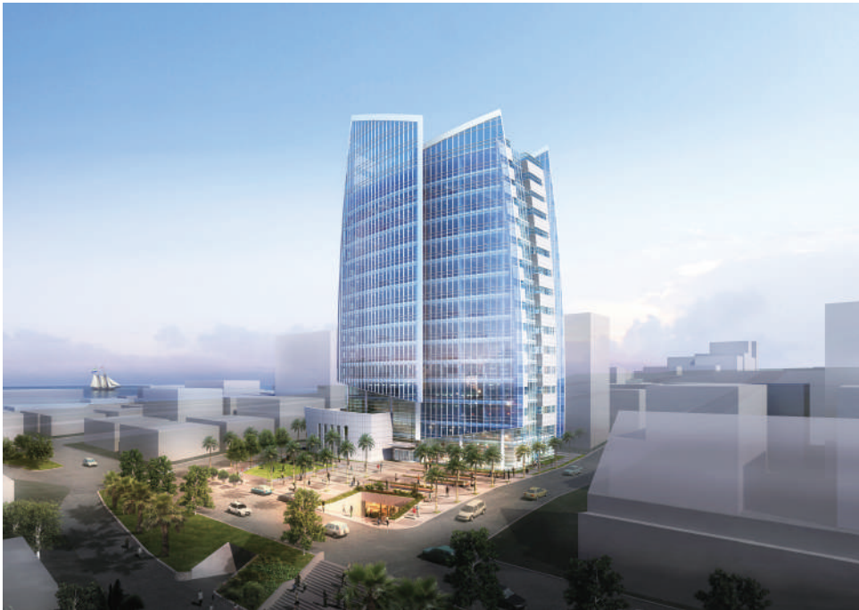
FREETOWN CITY ADMINISTRATIVE COMPLEX Construction Area: 20,069.18m 2 Floor: Underground 1 level, ground 15 levels

Client Freetown City Council(Sierra Leone) Construction period Oct. 12. 2017 ~ Dec. 31. 2020