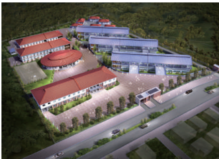
DUALA Construction Area: 21,664.69m 2 Floor: ground 1~2 levels(34 Buildings)

Client The Ministry of Employment and Vocational Training of Cameroon Construction period Aug. 31. 2015 ~ Feb. 14. 2013