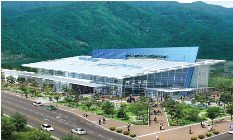
HAEUNDAE STATION OF DONGHAE SOUTH LINE (BUSAN-ULSAN) DOUBLE TRACK RAILWAY 3D BLOCK

Construction period Jun. 26. 2009 ~ Feb. 25. 2014