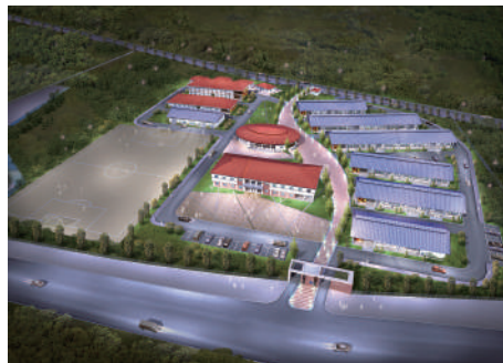
LIMBE Construction Area: 21,664.69m 2 Floor: ground 1~2 levels(34 Buildings)