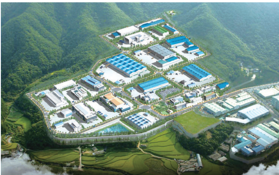
YANGSANG DEOKGYE GENERAL INDUSTRIAL COMPLEX

Construction period Jul. 12. 2011 ~ Feb. 25. 2015