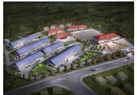
SANMELIMA Construction Area: 21,664.69m 2 Floor: ground 1~2 levels(34 Buildings)