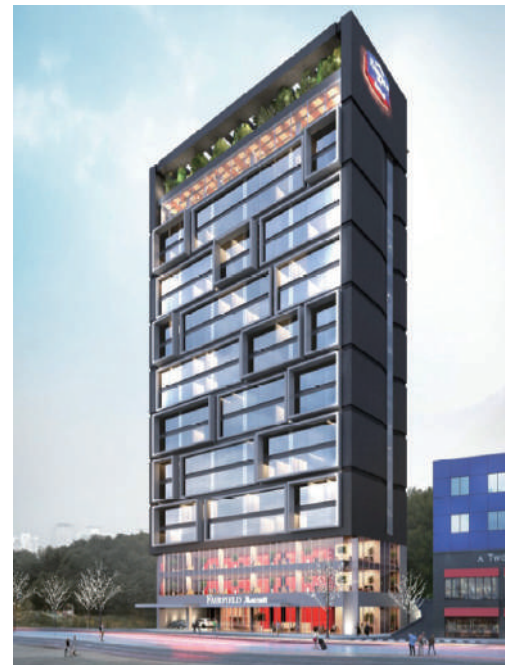
SONG DO FAIRFIELD MARRIOT HOTEL

Construction period Dec.1 2. 2017 ~ Apr. 08. 2020