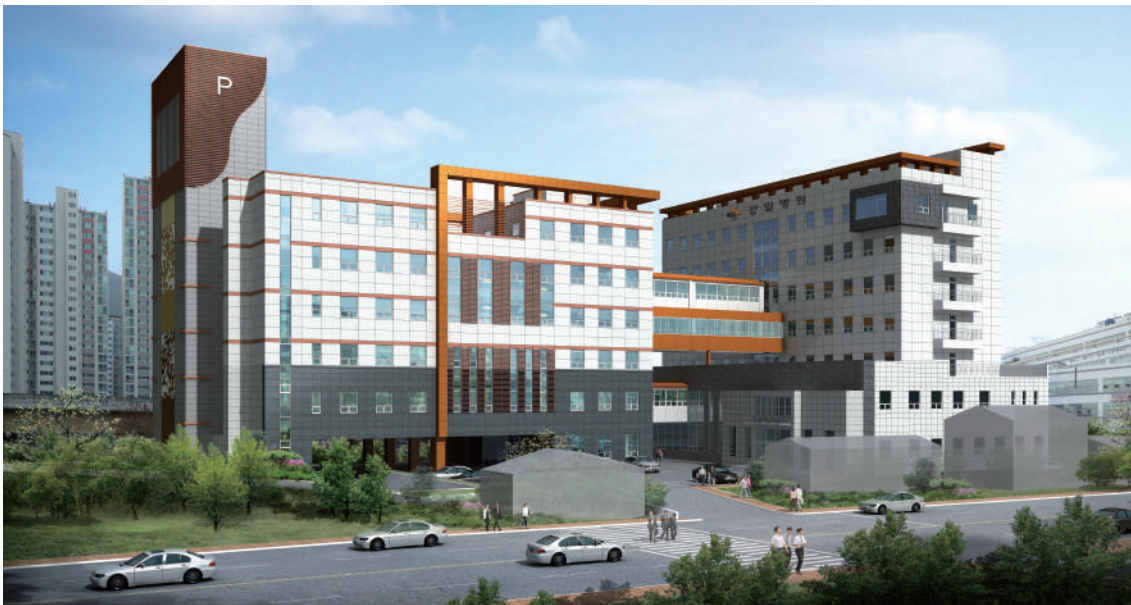
KANGIL HOSPITAL I Construction Area: 9,806.88㎡ Floor: Underground 1 level, ground 6 levels KANGIL HOSPITAL II Construction Area: 4,231㎡ Floor: Underground 1 level, ground 6 levels

Client Kangil Hospital Construction period Jan. 30. 2020 ~ Dec. 31. 2020